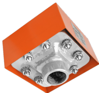
FLAME ARRESTER'S PRESSURE DROP